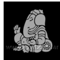
Ganapati Maharaj Ji [01]