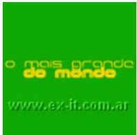
O Mais Grande do Mondo [01]