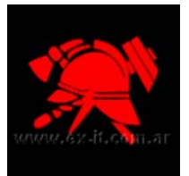
Kiev Fire Department [01]