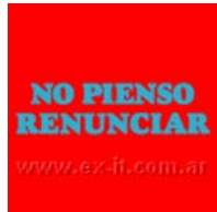
Cobos [04] No pienso renunciar