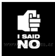
I Said NO [01]