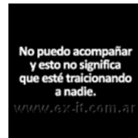
Cobos [01] No puedo acompañar