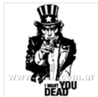
Uncle Sam [01]