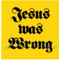
Jesus [06] was wrong