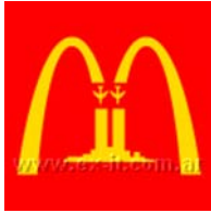
Eat This [01]