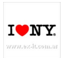
I (L) NY [01]