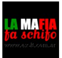
La Mafia fa schifo [01]