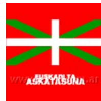
Euskadi Ta Askatasuna [01]