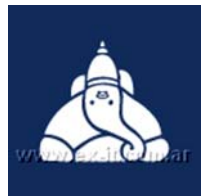
Ganesha Bhuvanpati [01]