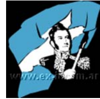
San Martin [01]