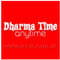
Dharma time anytime [01]