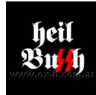
Heil Bush [01]