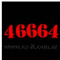
Nelson Mandela [04]