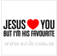
Jesus [04] loves you