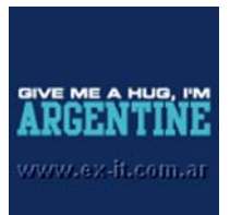
Give me a hug im Argentine [01]