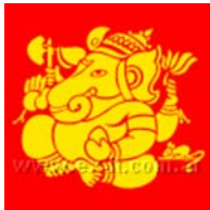
Lord Pitambar [01]