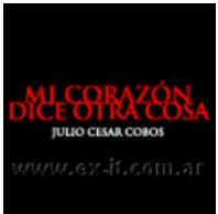
Cobos [03] Mi corazon dice otra cosa