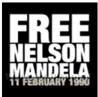
Nelson Mandela [02]