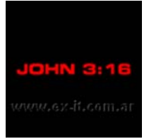
John 3 16 [01]