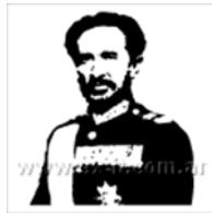
Haile Selassie [01]