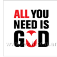
All you need is god [01]