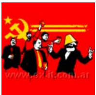
Communist Party [01]