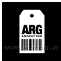
ARG Argentino [01]