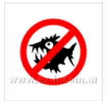
No a las papeleras [01]