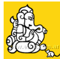
Varaganapati Bestower of Boons [01]