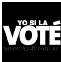
Yo Si LA Vote [01]