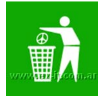
Trash All Hippies [01]