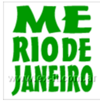
Me Rio de Janeiro [01]