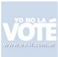
Yo No LA Vote [01]