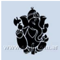
Lord Avaneesh [01]