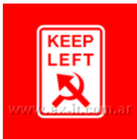
Keep Left [01]