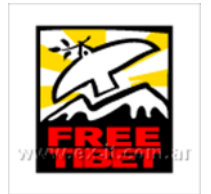
Free Tibet [02]