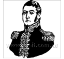
San Martin [02]