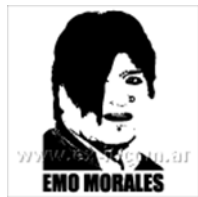
Evo Morales [02] Emo