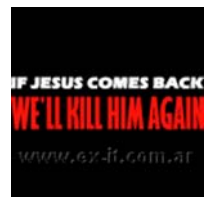
If Jesus comes back [01]