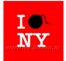
I (bomb) NY [01]