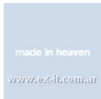
Made in Heaven [01]