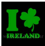
I (L) Ireland [01]