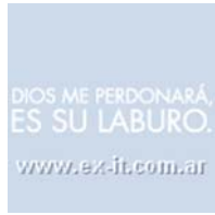
Dios me perdonara [01]