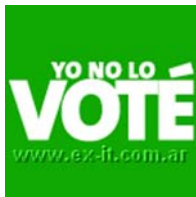
Yo No Lo Vote [01]