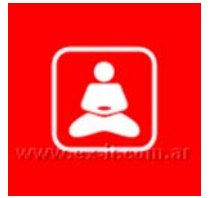
Meditation Zone [01]