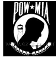
Pow Mia [01]