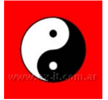
Yin Yang [01]