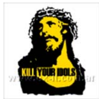
Kill your idols [01]