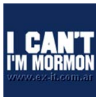
I cant Im mormon [01]