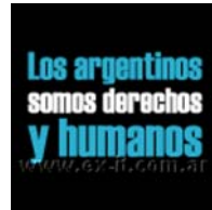
Los Argentinos somos derechos [01]