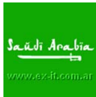
Arabia Saudita [02]