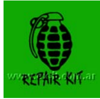
Repair Kit [01]