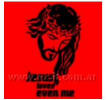
Jesus [03] loves even me