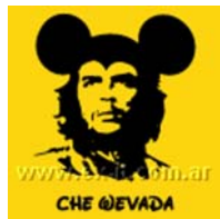
Che [05] Wevada