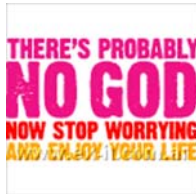
There's probably no God [01]