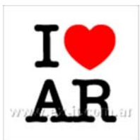
I (L) AR [01]