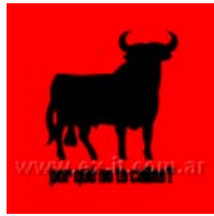
Por que no te callas [01]