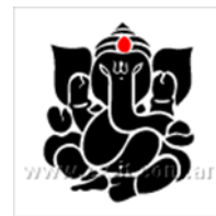
Vishwamukha Master of The Universe [01]