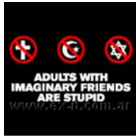
Adults with imaginary friends [01]