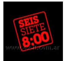
Seis Siete 8 [01]