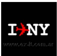
I (P) NY [01]