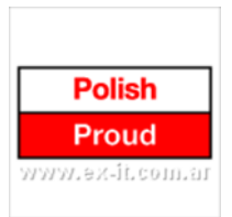
Polish Proud [01]