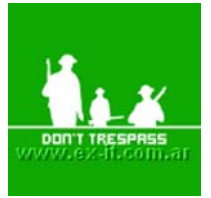
Dont Trespass [01]