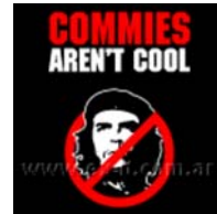
Commies Arent Cool [01]