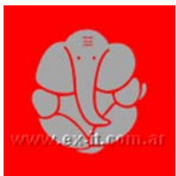
GaneshaThe Mahaganapati [01]