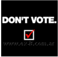
Dont vote [01]