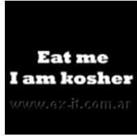
Eat Me [02] Im Kosher