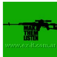
Make Them Listen [01]