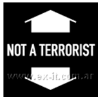
Not a Terrorist [01]