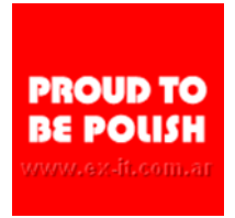
Proud to be polish [01]