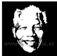
Nelson Mandela [03]