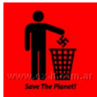
Save The Planet [02]