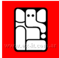
Lord Ganapati [01]