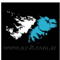
Islas Malvinas [01]