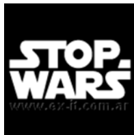
Stop Wars [01]