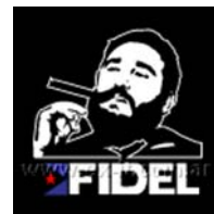
Cuba [04] Fidel