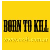
Born to Kill [01]