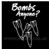
Bombs Anyone [01]