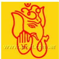
Vinayaka Lord of All [01]