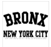
Bronx [01] New York City