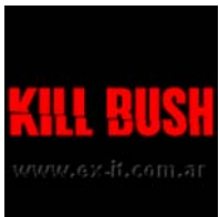
Kill Bush [01]