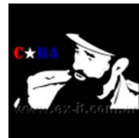
Cuba [01] Fidel