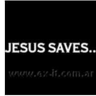
Jesus Saves [01]