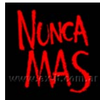
Nunca Mas [01]