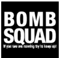
Bomb Squad [01]