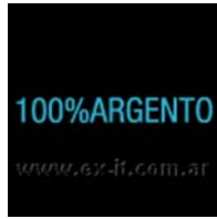
100 Argento [01]