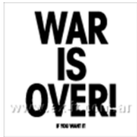
War Is Over [01] If you want it