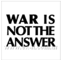
War is not the answer [01]