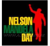
Nelson Mandela [01]