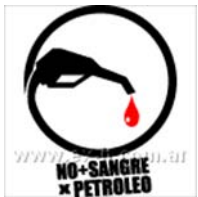
No mas sangre [01]