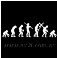
Evolucion de la religion [01]