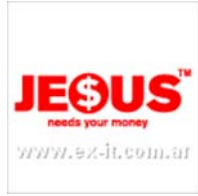
Jesus [05] Needs Your Money