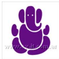
Varadavinayaka Bestower of Success [01]