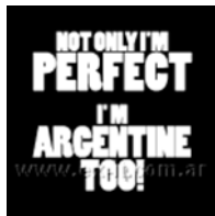
Not only Im Perfect [01]