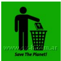
Save The Planet [01]