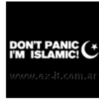
Dont Panic [01]