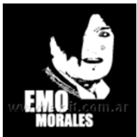
Evo Morales [01] Emo