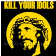
Kill your idols [02]