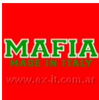
Mafia Made in Italy [01]