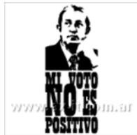
Cobos [05] Mi voto no es positivo