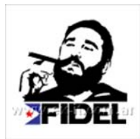
Cuba [03] Fidel