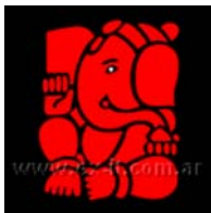
Gajananeti Elephant Faced Lord [01]