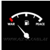
War Peace [01]