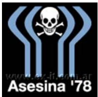
Asesina 78 [01]