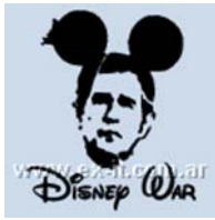
Disney war [01]