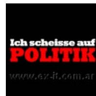
Ich scheisse auf politik [01]