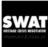
Swat [02] Hostage Crisis Negotiator