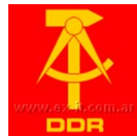
Germany [03] Deutsche Demokratische Rep