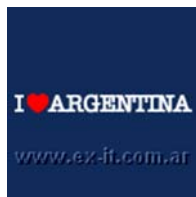
I (L) Argentina [01]