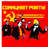
Communist Party [02]